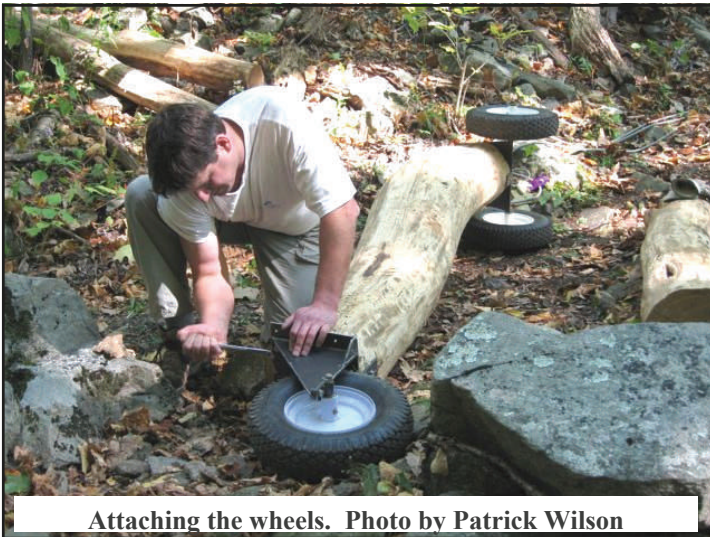
Attaching the wheels.

Maintainers needed to haul black locust logs hundreds of yards uphill to the work site. Using a crosscut saw and axe, workers prepared 35 seven-foot logs. To ease the strain of pulling the logs up the slope, Patrick Wilson attached wheels to the logs. Even with the wheels to assist, it took two strong people half a day to move one of the largest logs into place.