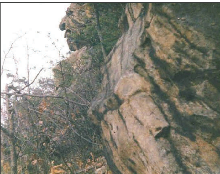
The Old Man of Second Mountain, located seven miles north of Harrisburg, halfway through the Dauphin Narrows.

The profile—looking as they almost invariably do, like an Indian chief—is about as clear a job of artistry as nature can do. Some viewers deem it more true to the human face than is “The Great Stone Face” of New Hampshire. [Ed. Note: the New Hampshire profile fell in 2003].